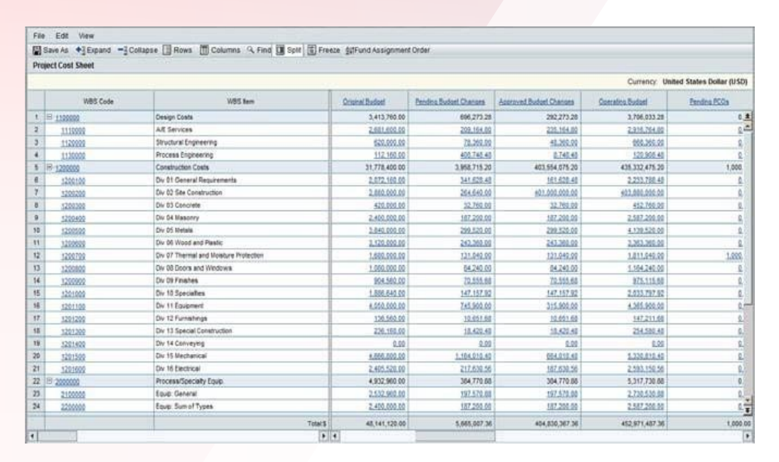
Figure 2 - Primavera Unifier's spreadsheet-like interface makes it easy to tailor your costs sheets to match your existing standards

The cash flow management feature is fully integrated with the business processes, cost sheets, schedules, and portfolio manager within Primavera Unifier and can also make use of data integrated from Primavera P6 EPPM.