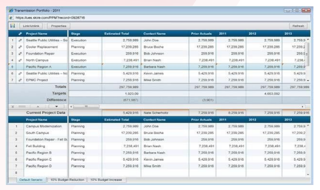
Figure 1 - Information in Primavera Unifier is displayed in an easy-to-read grid format that supports manipulation of large amounts of data

With Primavera Unifier, you can create multiyear plans with information from ongoing projects rolling into subsequent period portfolios. In addition, you can manage multiple types of portfolios with different project types, with roll-up reporting across the entire organization.